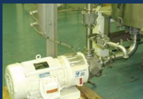
Explosion-proof high efficiency motor. Stainless steel and/or washdown duty motors available.

For more information on high shear mixers: