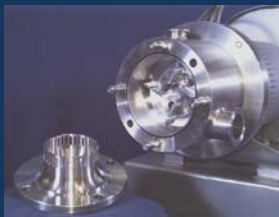
Stainless steel 316 product contact parts, polished to 150-grit (32 Ra) finish. Sanitary 3A-approved models available.