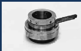
Cartridge-type single mechanical seal. Double mechanical seals may be chosen for high-temperature or demanding applications.