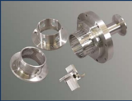
Four-blade rotor and interchangeable stators (slotted, round hole disintegrating and fine-screen).